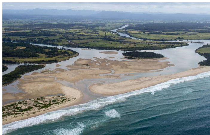
Manning River entrance at Old Bar