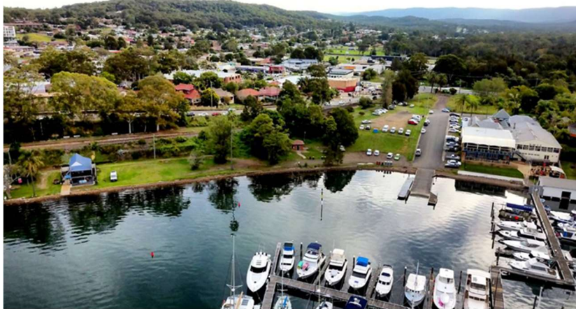
Toronto Royal Motor Yacht Club